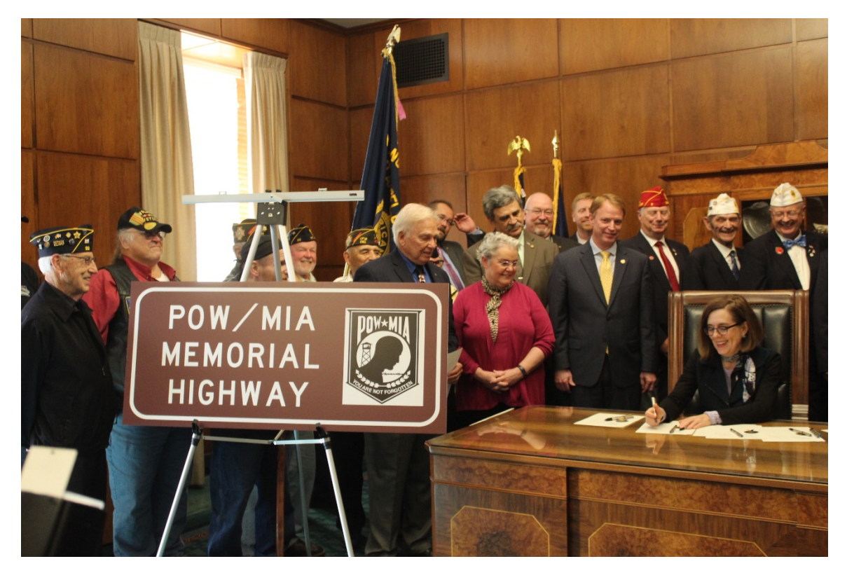
HALF SCALE POW/MIA MEMORIAL HIGHWAY SIGN WITH GOV. BROWN SIGNING HB 3452 SEPT. 16, 2019